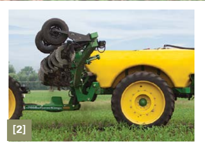
[1] Field position - fully raised [2] Rotational lift toolbar [3] Asymmetrical tank design [4] Tires and axles [5] Transport position

The new 1860 and 2460 liquid applicators from Farm King provide an industry leading crop clearance to extend your liquid application window. The 1860 and 2460 have an impressive in row crop clearance of 36" and more than 54" of crop clearance on headland or turning rows. A custom designed asymmetrical tank helps maintain a consistent tongue weight regardless of the product volume in the tank. The cutting edge design and easy to use operation make the 1860 and 2460 the best available 60' applicators on the market.